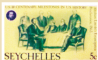
Abraham Lincoln's Emancipation Proclamation 1863

Five days before – on the 29th June 1976, the Seychelles had become an independent Republic with James R. Mancham as its first President. In no time, the Seychelles Government issued a set of stamps to mark several milestones in US history. They were among the first Seychelles stamps to bear the effigy of President Mancham and they went a long way to testify the prevailing friendship and understanding between the Republic of Seychelles and the United States of America.