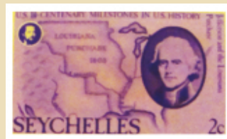
Jefferson and the Louisiana Purchase

T HE US Constitution protected slavery issue so skillfully. Lincoln came to believe, the Commander in Chief could abolish slavery as a military necessity. The preliminary EMANCIPATION PROCLAMATION of Sept. 22, 1862, bore the military justification, as did all of Lincoln's racial measures, including especially the decision in the final proclamation of Jan. 1, 1863, to accept blacks in the army.