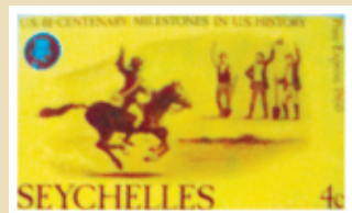
Pony Express – 1860

Although Napoleon I originally intended to establish a new empire in America, he sold Louisiana to the United States in 1803. The $15 million LOUISIANA PURCHASE represented about 4 cents an acre. Louisiana became the 18th state on Apr. 12, 1812, comprising the territory south of 30 degrees North latitude, which had been the Territory of Orleans.