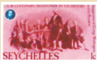
Inauguration of Georges Washington as First President of the USA

George Washington 1st President of the United States (1789-97)