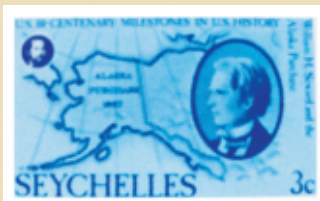
William H. Seward and the Alaska Purchase